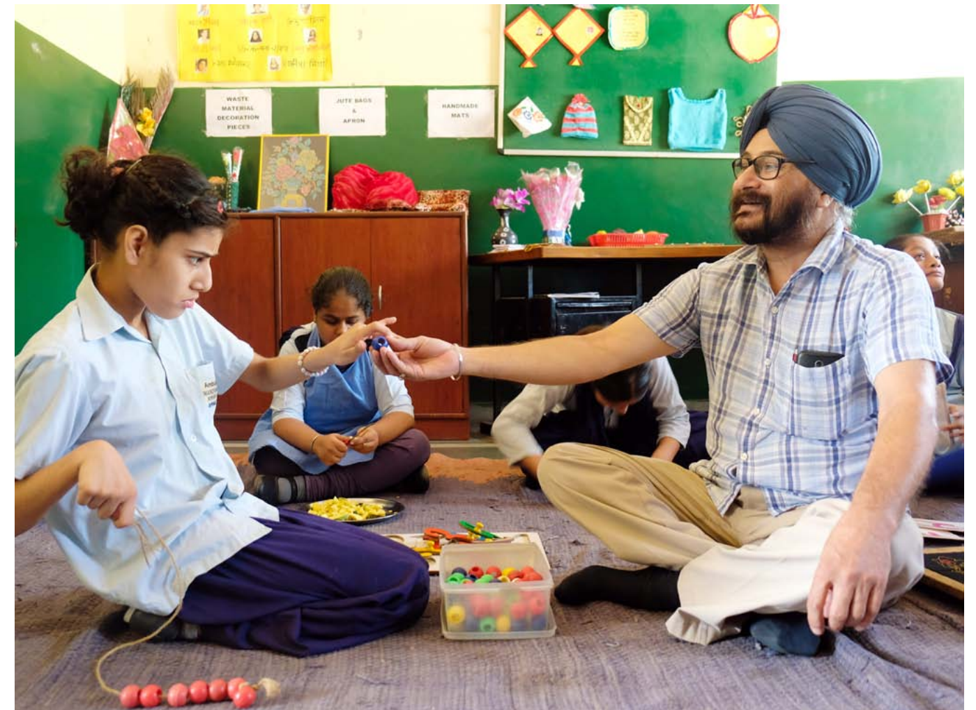
▲ Ambuja Manovikas Kendra improves the quality of life of differently-abled children

dialogue to involve people and help them see that this is the best way for sustainability in the future.