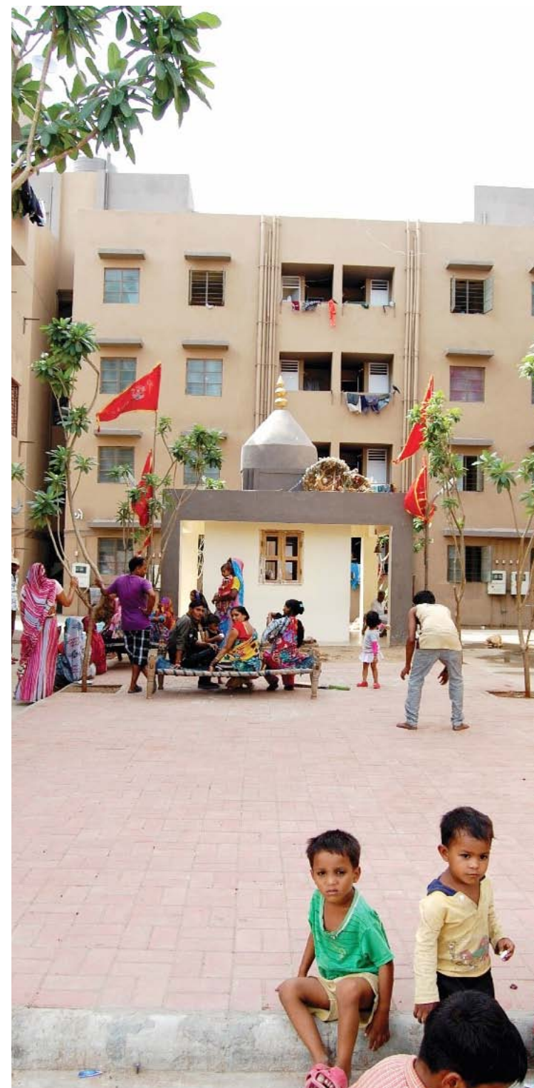
▲ A housing project completed through MHT

As slum housing is upgraded and infrastructure