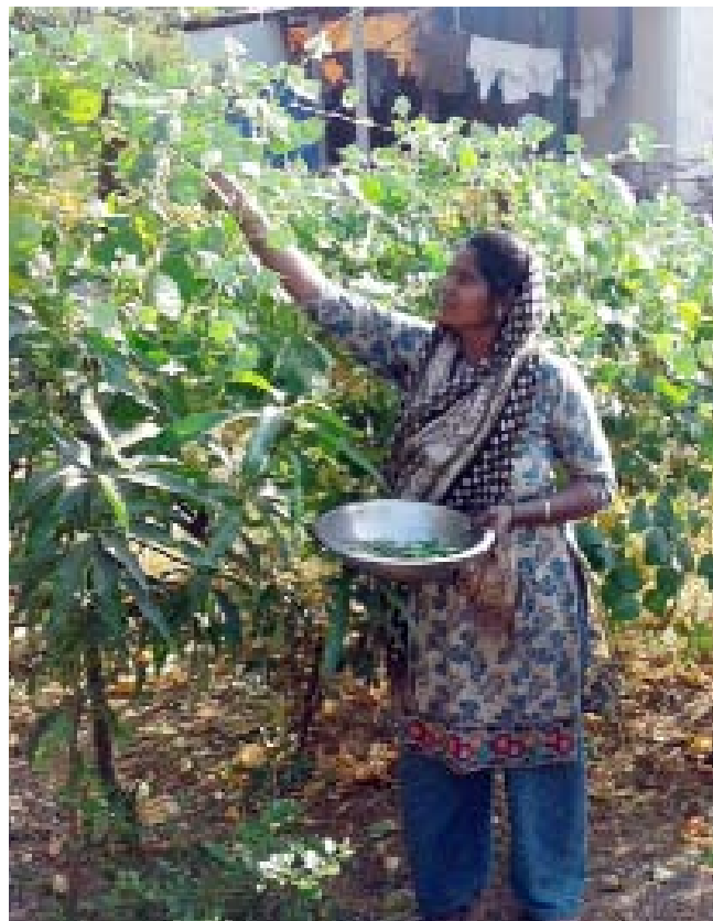
▲ Kitchen gardens are encouraged under ICDP

L&T's presence at Pathardi is no accident. Far from it, it's the outcome of an elaborate exercise of water-starved areas conducted at the conceptualisation stage. Despite it being widely known as a water-stressed area for decades, Pathardi received little to no institutional aid before L&T began its project in 2015. NGO partner WOTR mapped the tehsil and helped identify the six-village cluster for ICDP and it is WOTR's reach in the local community combined with the technical expertise of L&T that the project has attained its success.