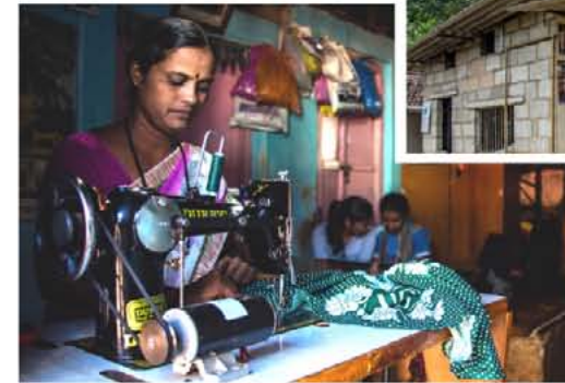
Tailor in Karnataka using a Solar Powered Sewing Machine

India’s vulnerable and poor communities are now using solar energy to improve their lives in more ways than one