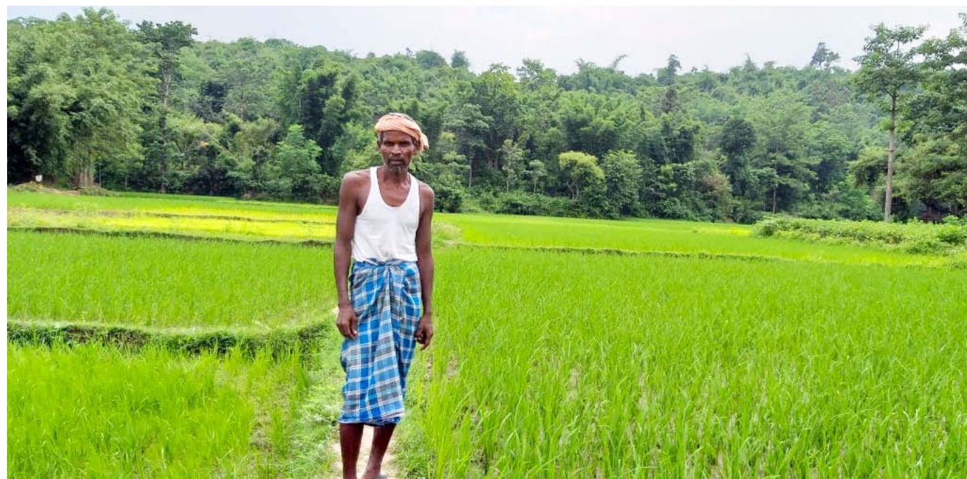
▲ A Farmers reaps the benefits of FFS

convince farmers for modifying the present practices and adopt new ecologically sustainable techniques. FFS proved to be an effective tool in demonstrating improved and climate-smart practices and encourage its replication with multiplier effect. IGSSS planned out demonstration of key agri-practices through FFS with carefully selected cadre of participants in consultation with the Village Development Committees (VDC), the apex village bodies. Without disturbing the cropping pattern, climate-smart techniques such as Systematic Rice Intensification (SRI), Systematic Wheat Intensification (SWI) and Systematic Mustard Intensification (SMI) were introduced. Drought resistant varieties of paddy, cultivation of pulses and oil seeds like red gram, green gram and groundnut, vegetables which require less water, are also being promoted through FFS.