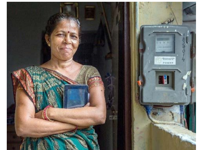
▲ Electricity in slum housing is ensured by MHT

In 2010, a developer approached the slum residents with a plan to rehouse them in formal flats on the same land under AMC's public-private-partnership programme. However, some residents were skeptical to participate and feared losing their homes. "The slum dwellers perceived SRS (Slum Rehabilitation Scheme) either as a novel eviction strategy of the government, or an opportunity