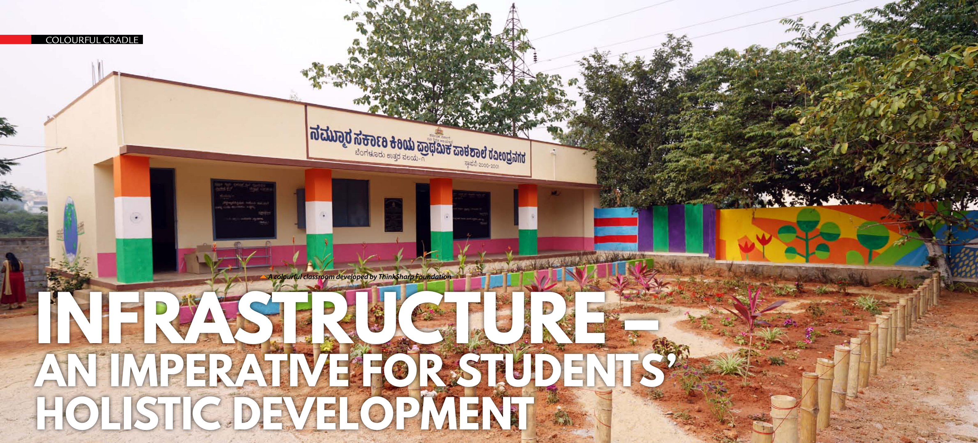
▲ A colourful classroom developed by ThinkSharp Foundation