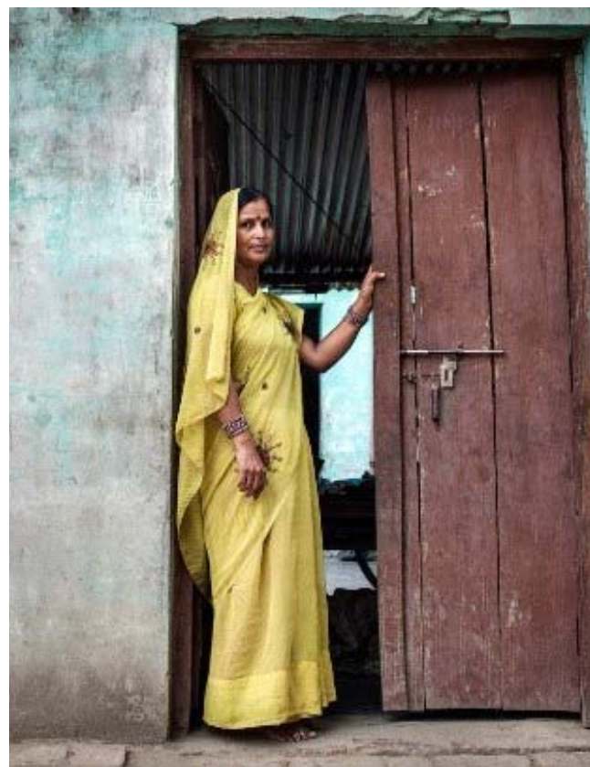
▲ MHT advocates pro-poor housing policies

also train slum communities to collect, analyse and use this data to provide local inputs in city-level planning efforts.