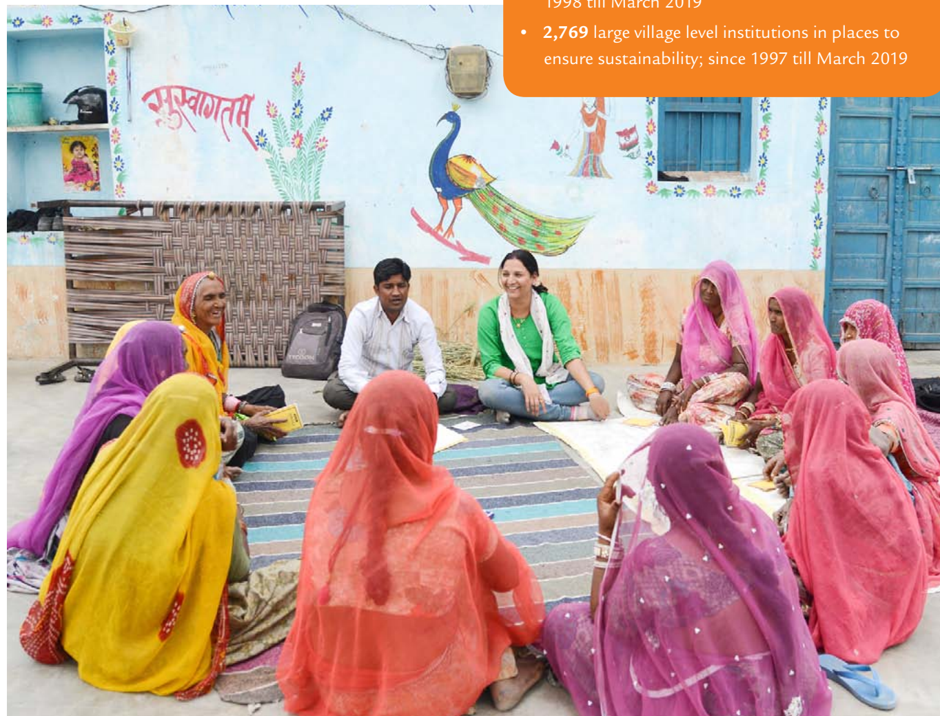
▲ Women empowerment is a key functional area of ACF

(Contribution by Ambuja Cement Foundation for The Good Sight)