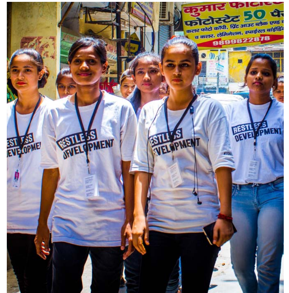
▲ Restless Development's programmes are designed and delivered by youth

take the lead in development, and that one young person has the ability to influence many. We have been a witness to it on countless occasions.