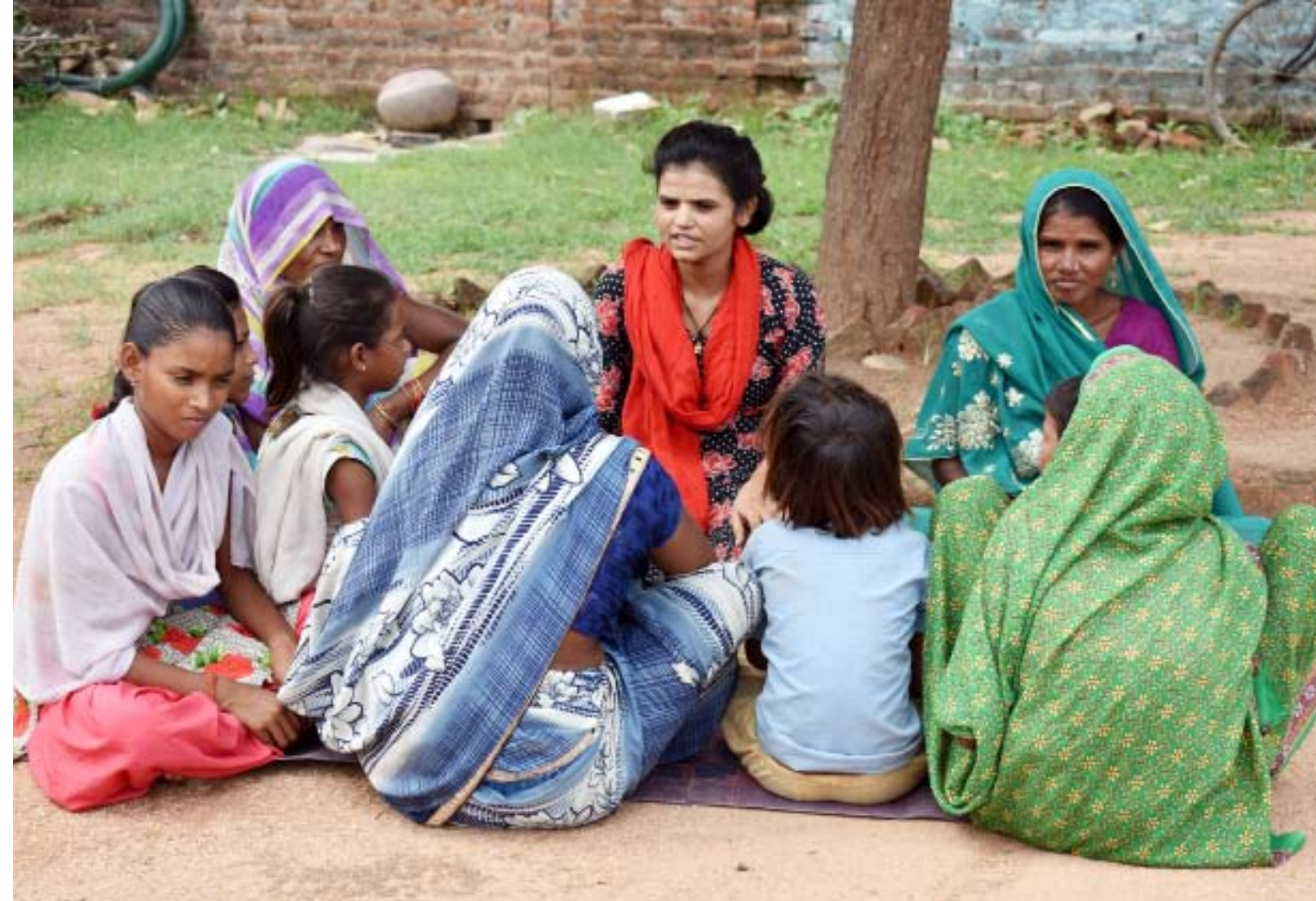
▲ An awareness session on nutrition