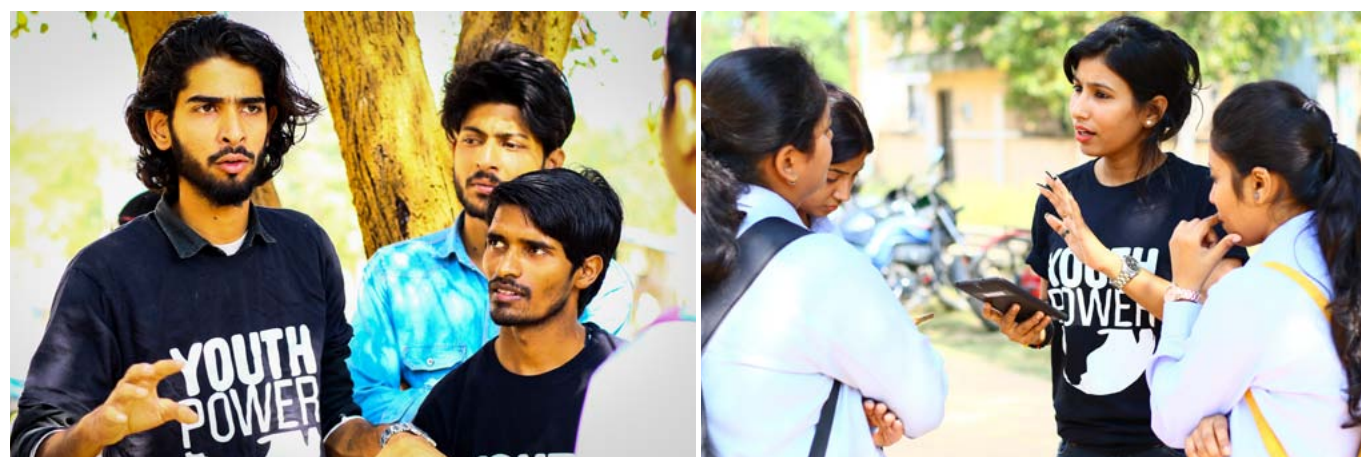
▲ Youth volunteers gather data to achieve gender equality and family planning targets

change across the world. Restless Development is championing a growing movement led by this new generation. Our vision is that everywhere young people are able to demand and deliver a just and sustainable world. The strategy is not about harnessing the power of youth to do what others think is best. It's about unleashing youth leadership as an agency of change in its own right. With our Restless Model putting youth at the heart of development, we believe to have the key to unlock this potential on a global scale. When young people all over the world would say, "Thanks, we'll take it from here," that day we would have a sense of achievement in the truest form. ■