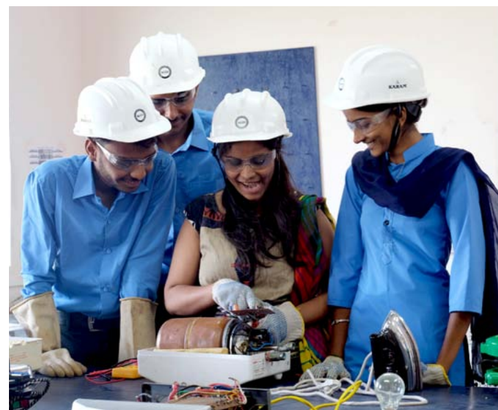
▲ ACF runs skilling institutes for rural youth

This approach has worked as far as ACL is concerned. Across all locations of ACL, community members contributed a total of almost Rs 19 crore last year - from building toilets to helping create water harvesting structures. Everyone pitched in and the community members now feel proud, responsible and empowered as a result. In order to overcome the initial resistance from communities, ACF team members do a lot of community