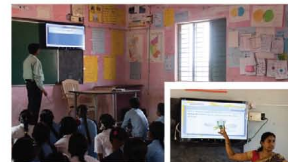
Solar Powered Digital Education in Government High Schools in Karnataka