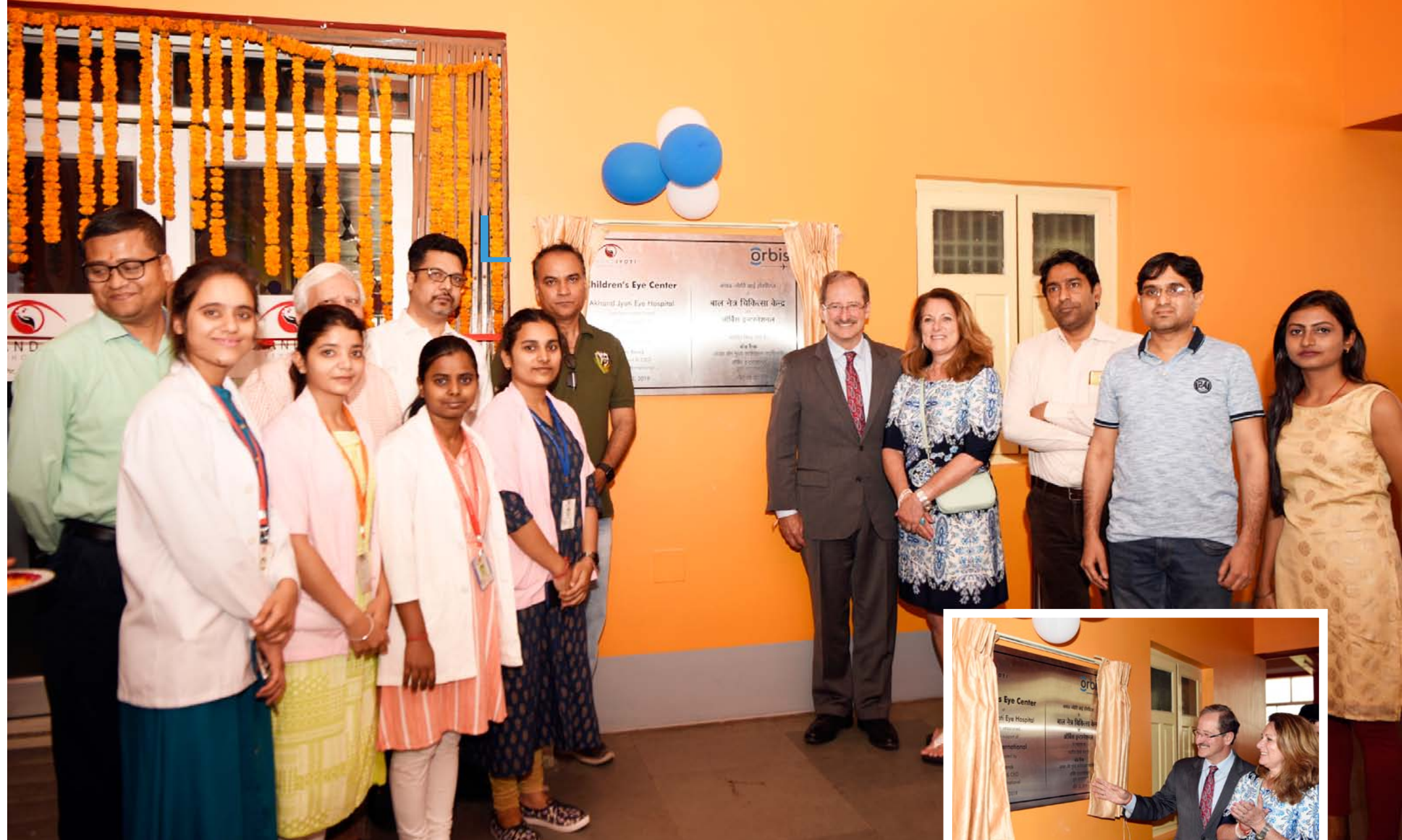
▲ Orbis and AJEH team members at the inaugural

Orbis and Akhand Jyoti Eye Hospital come together to set up Bihar's first Children's Eye Centre