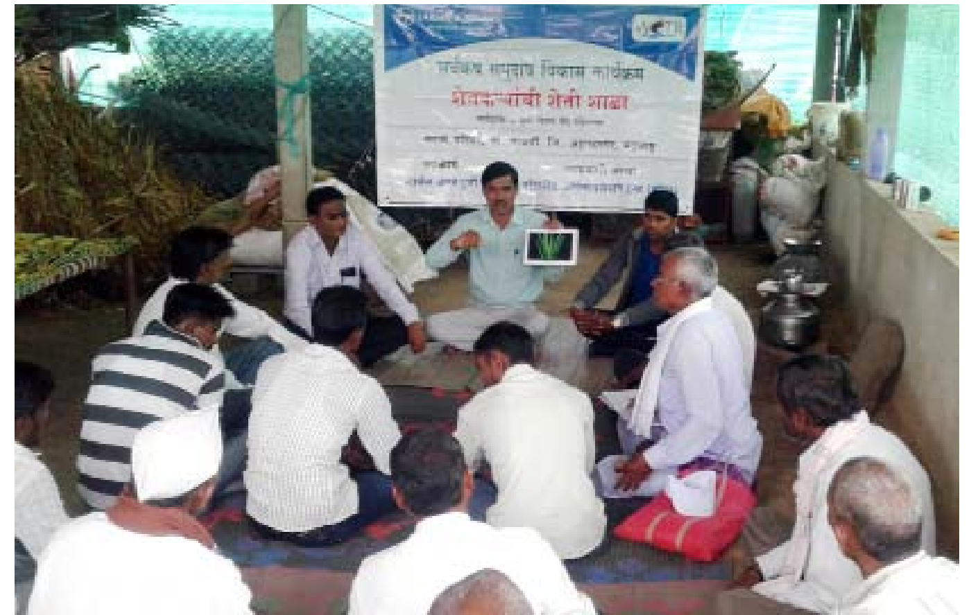
▲ Farmers learn sustainable agriculture practices at a workshop

Difficult as it was, the project team incentivised this by putting up a small corpus from which the women could take petty loans and start their own business. A formal structure was put in place for issuing loans and repaying the money. Used as a revolving fund, the money loaned to