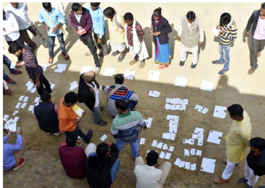
▲ Volunteers undertaking a group task to map crops