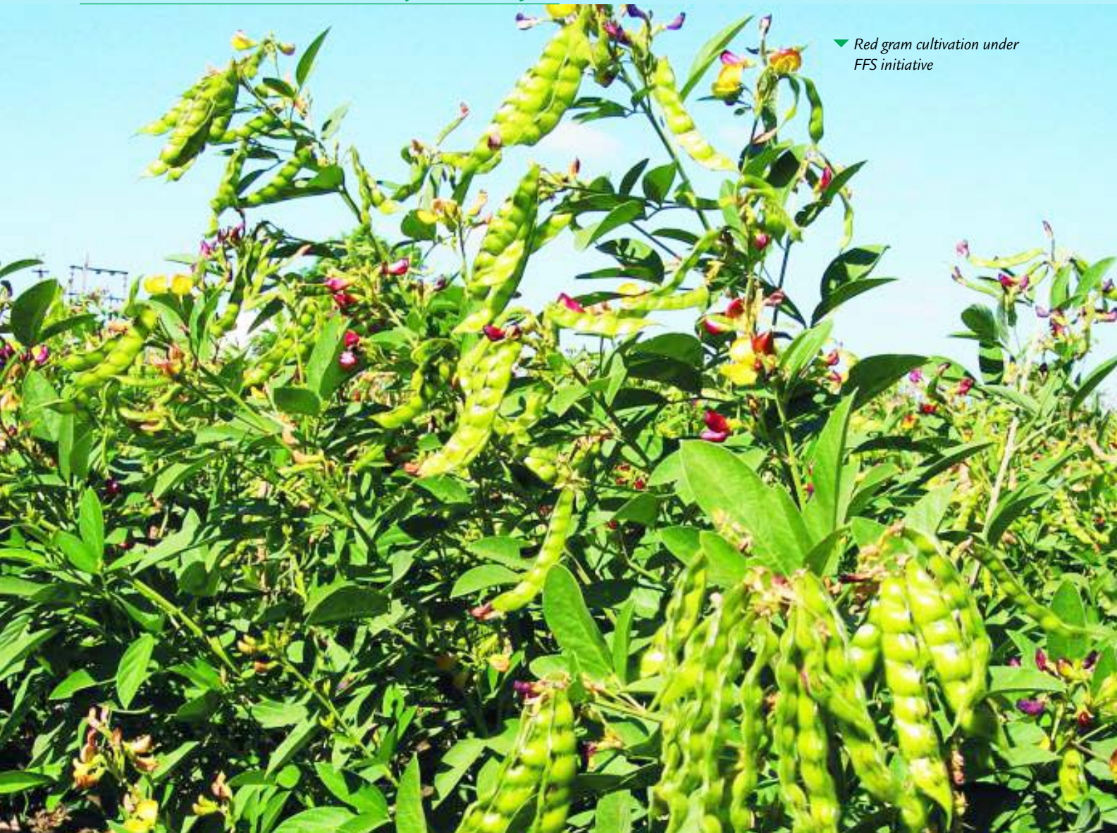
▼ Red gram cultivation under FFS initiative

Shikha Srivastava and Sukanya Chatterjee