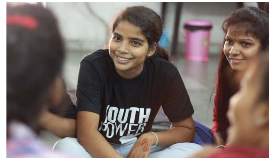
▲ Plan-It Girls programme is delivered through group education activities

A: Yes, a lot has changed in the way development is done. The 60's and 70's were an era of optimism. Post-independence, the focus was also on improving the service delivery of essential services. Also, this period witnessed the entrance of big international development organisations entering into long-term MoUs with the Indian government and undertaking the chunk of development initiatives. Towards the 80's the sector strengthened, with a very strong rights based focus and took on the responsibility of largely playing the role of a watch dog, with a very left wing school of thought, serving as