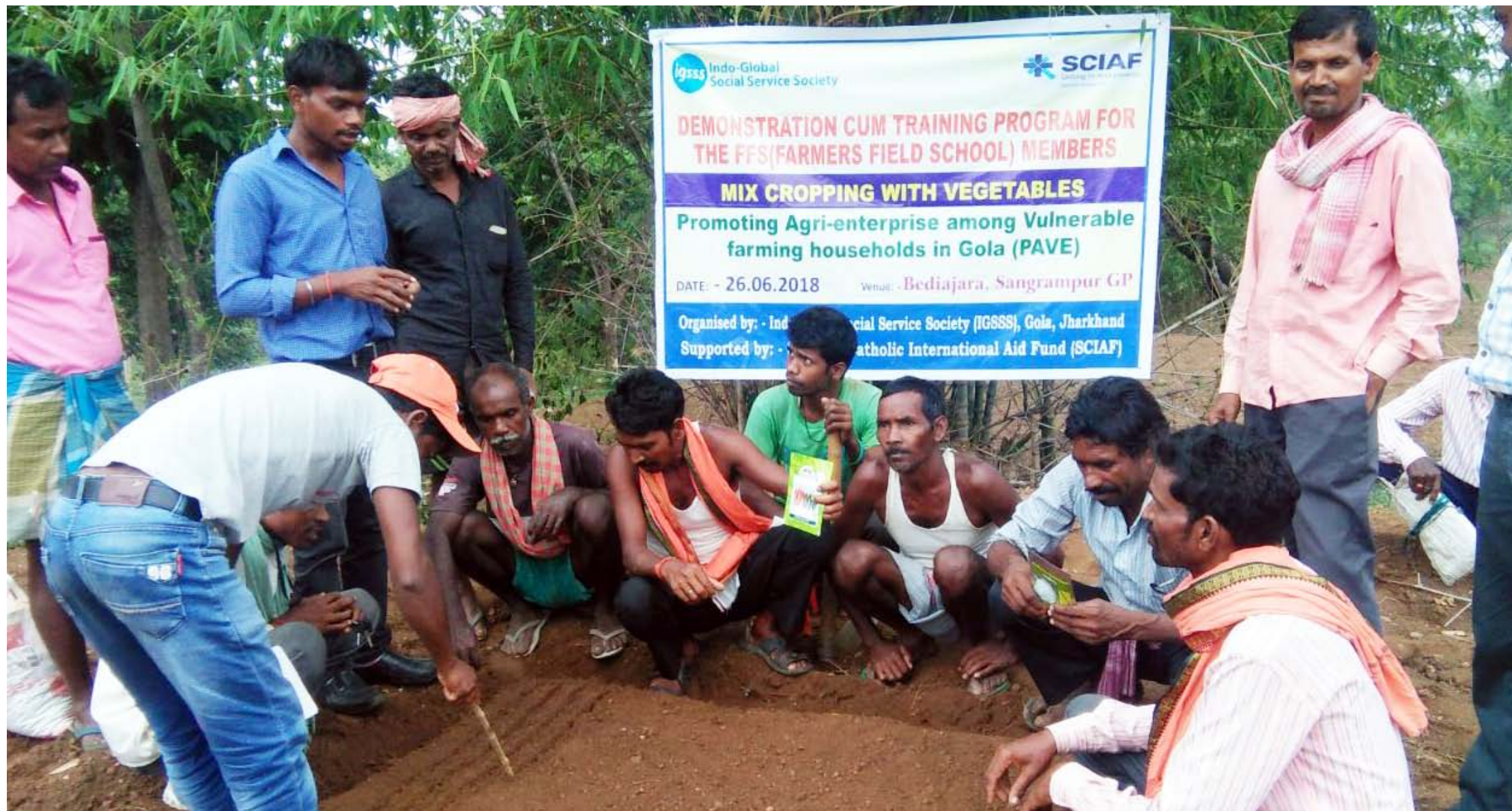
▲ Under the FFS initiative, farmers undergo training