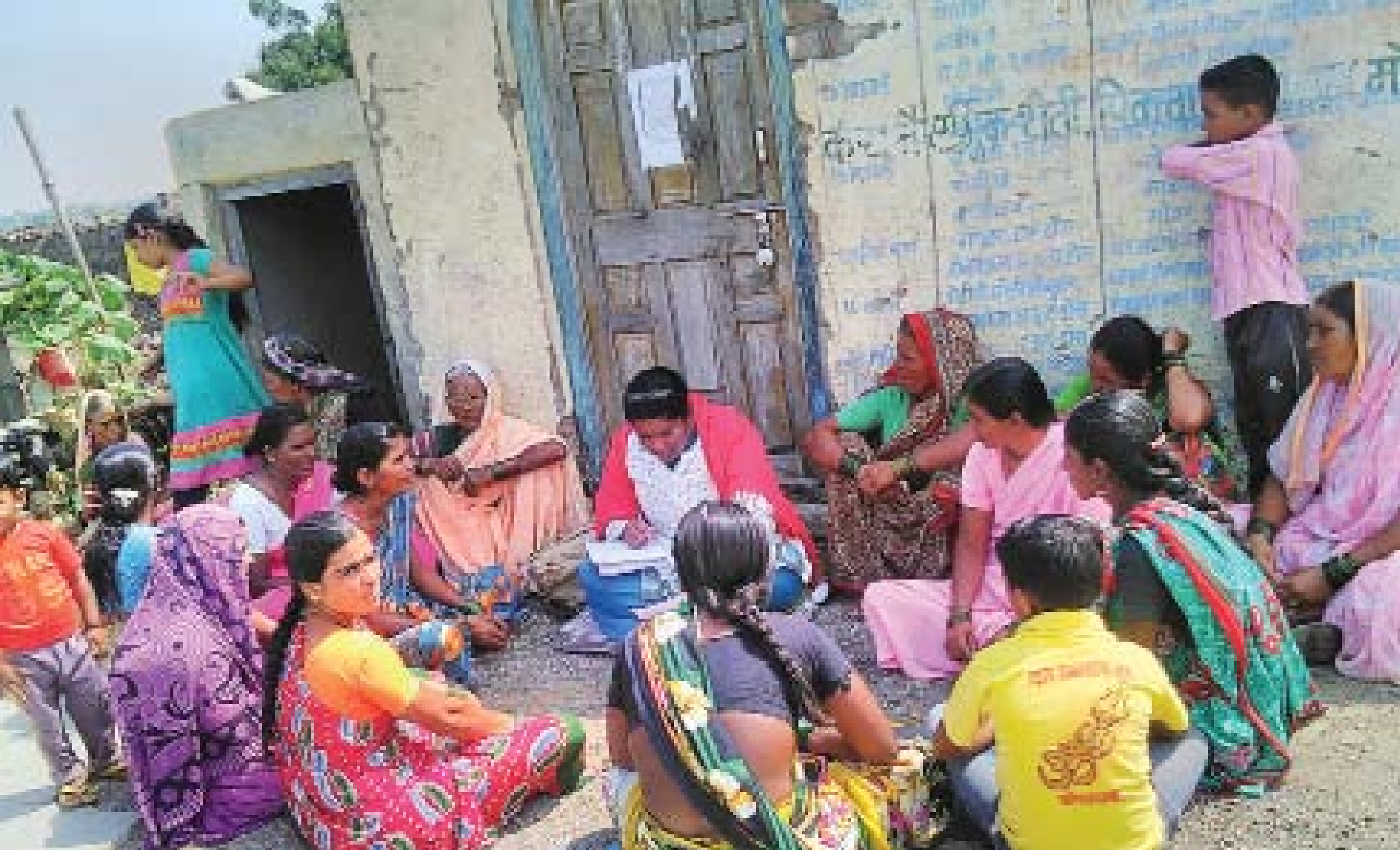
▲ Women empowerment is integral to L&T's ICDP