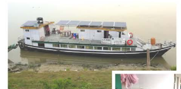
Solar Powered Boat clinics in the Brahmaputra in Assam’s Riverine Islands

Solar energy, energy efficient health appliances and appropriate delivery models are helping health personnel provide vaccination, diagnosis and treatment at very last mile