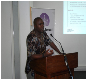
Our staff during the State of Youth breakfast debate

It is our approach to share and learn from stakeholders, as we believe genuine transformative change will happen through building a strong youth sector and shaping policies and practices which reflect what young people are saying from in our consultation studies.